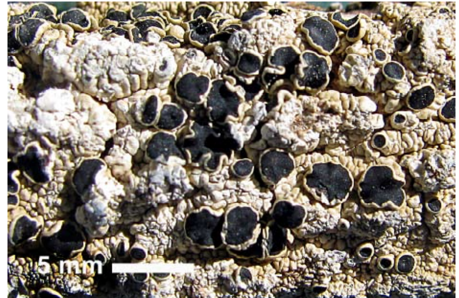
Fig. 1. Tephromela erosa (holotype in CANB).