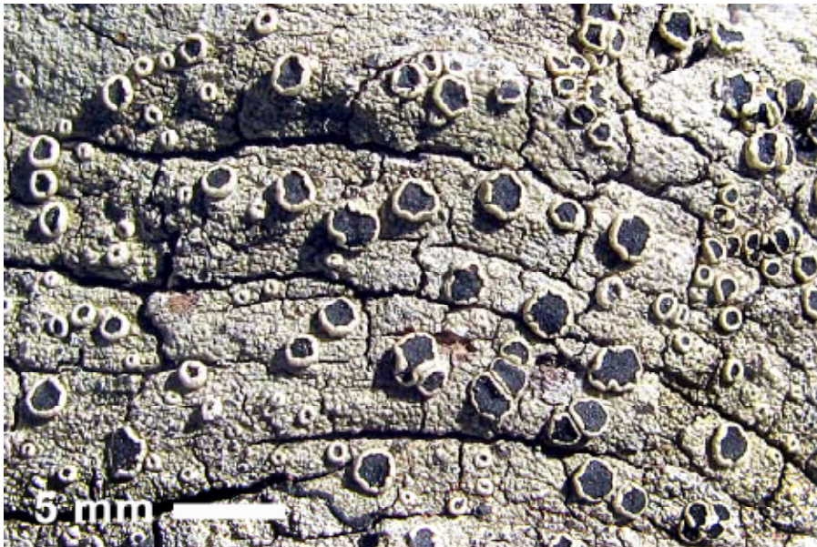
Fig. 2. Tephromela neobunyana (holotype in CANB).