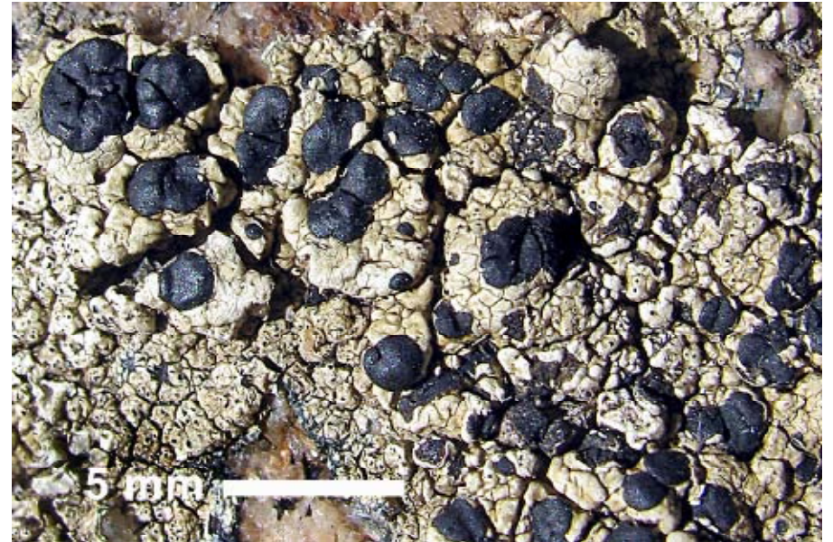
Fig. 5. Tephromela promontorii (J.A. Elix 21784 in CANB).