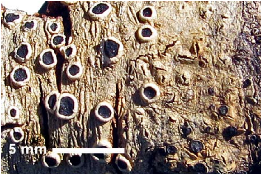
Fig. 3. Tephromela nothofagi (J.A. Elix 24858 in CANB).