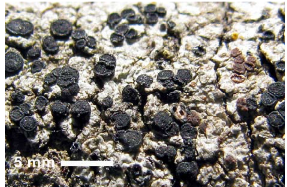
3. Amandinea dudleyensis (holotype in HO).