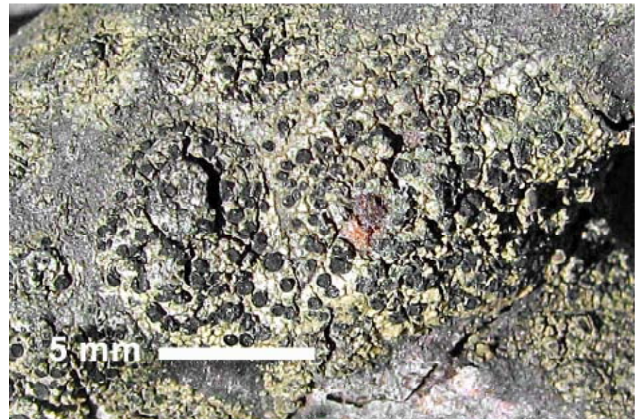
7. Amandinea stajsicii (isotype in CANB).