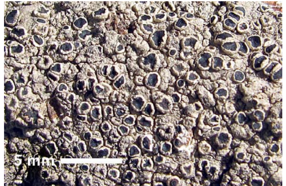
Fig. 4. Tephromela americana (J.A. Elix 16472 & H. Streimann in CANB).