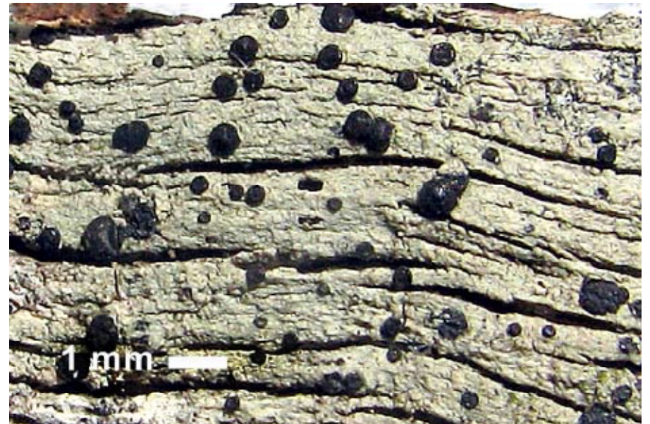
6. Amandinea pillagaensis (J.A. Elix 38639 in CANB).