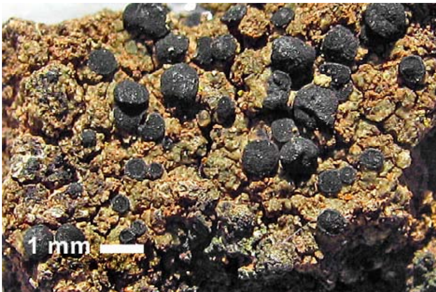
5. Amandinea occidentalis (holotype in CANB).