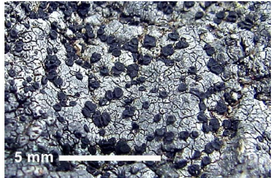
2. Amandinea devilliersiana (isotype in CANB).