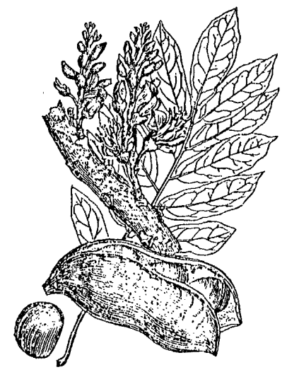
Figure 1. The black bean. Reproduced from Vegetable Substances.